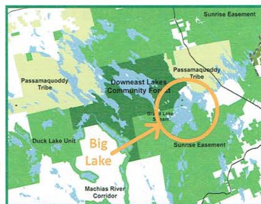
Downeast Lakes Land Trust and the Passamaquoddy Tribe are major stakeholders in the region.

In the weeks and months to come, LSM will participate in a flurry of planning meetings and outreach events, working in collaboration with all stakeholders to help develop a comprehensive plan for responding effectively to the Big Lake infestation. In addition to public meetings and strategy sessions, LSM will offer a series of IPP trainings in the Big Lake area next summer, with the goal of engaging and strengthening the capacity of the local community as they move forward