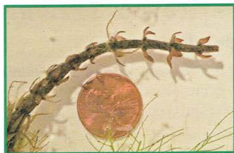
Emergent stems with whorls of finely-serrated, blade-shaped bracts are diagnostic for invasive variable water-milfoil.