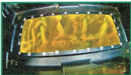
The tall bottle-bush-like stems of variable water-milfoil were still defiantly erect, vibrant, formidable, menacing.

Splitting up into two units to maximize direct observation, the boats proceeded in opposite directions around the bay. The sky was cloudy but bright, the winds light, and the water clarity good; we were able to cover most of the perimeter of Clifford Bay and some of the shallower off-shore areas. Our findings were not good. Much of the nearshore perimeter was dotted with individual and clustered milfoil plants. The plants were not only abundant and widespread, but also vexingly mixed in among the natives. We also found several additional large patches including one that encompassed the greater part of one large cove. Here, senescing flower stems were everywhere. In a nutshell, our findings revealed that the invasive milfoil was not, as we had all so keenly hoped, contained to the area near Brad's camp. Rather, the infestation was quite extensive throughout Clifford Bay, indicating that the invader has been present in Big Lake for a number of years.